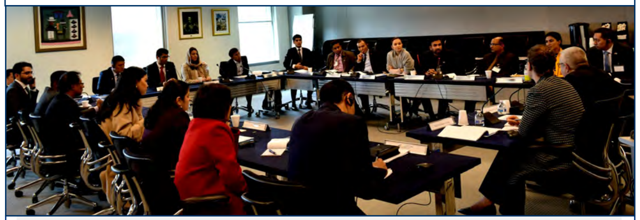
Silk Road participants, during a lecture on the art of diplomacy with Ambassador Richard Hoagland.

WASHINGTON-April 2-6, 2018- The Near East South Asia Center for Strategic Studies (NESA) conducted a capacity-building seminar for 20 emerging leaders from 10 NESA countries in South and Central Asia on the theme of "Statecraft and Decision-Making in the 21st Century."