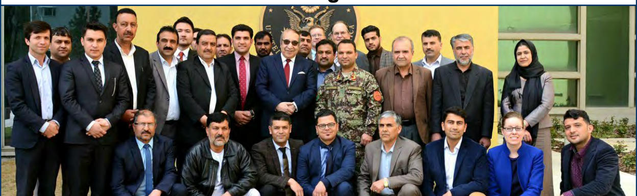
Emerging Afghan leaders and NESA faculty take a group photo, outside the U.S. Embassy in Kabul.

KABUL, Afghanistan- March 24-27, 2018- The Near East South Asia (NESA) Center for Strategic Studies conducted a capacity building seminar, held specifically for 'Future Leaders of Afghanistan', at the U.S. Embassy Compound in Kabul.