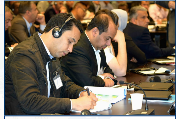
CTSES Participants take notes in a morning session

Participants traversed a plethora of transnational threat topics such as lessons learned from the Iraq and Afghanistan wars,