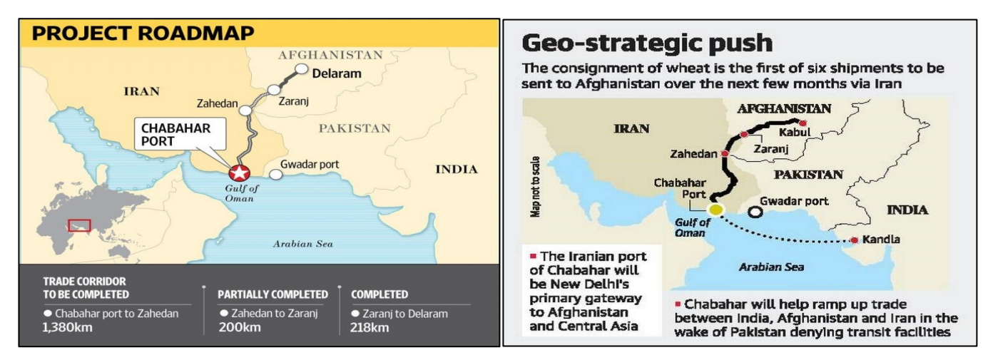
Figure 2. The Strategic Push for the Chabahar Port