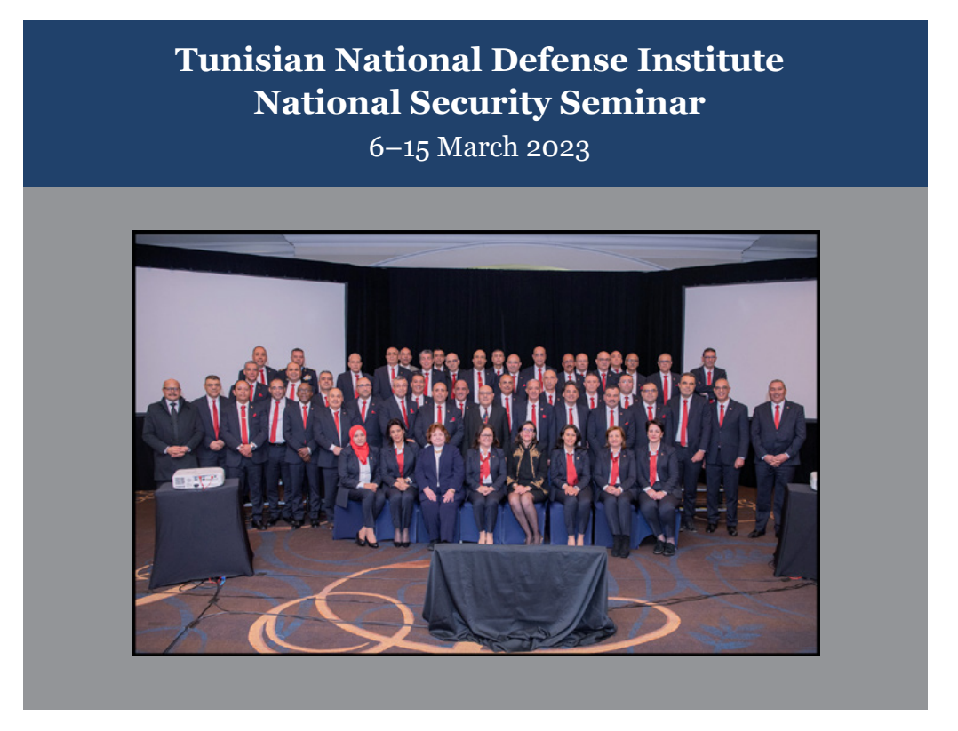
Group photograph of the TNDI National Security Seminar held from 6–15 March 2023.