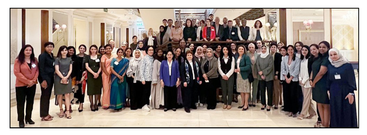
NESA-AFRICOM Workshop Series held from 29 April–6 May 2023 in Bangkok, Thailand.

From 29 April–6 May 2023, the Near East South Asia (NESA) Center for Strategic Studies, in partnership with U.S. Africa Command, held three back-to-back workshop series in Bangkok, Thailand, for senior government and civilian security experts and a "whole of society" approach from 24 countries with a total of 53 female participants. The 61 from 24 countries in attendance came from various countries across the globe: Latin America, Africa, The Levant, Central Asia, the Gulf, and South Asia. This was the first-ever program of this type conducted by the NESA Center. Under the leadership of Course Director Professor Anne Moisan and Deputy Course Director Fahad Malaikah, the three back-to-back workshops, which topically built on each other, covered: "The Changing Nature of Security" followed by "Transnational Threats Know No Boundaries" and culminated with a two-day Women's ONLY session entitled "The Women's Revolution: Life, Liberty, and Freedom." <a href="https://nesa-center.org/nesa-africom-workshops">https://nesa-center.org/nesa-africom-workshops</a> and nesacenter wps e-book/