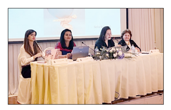
NESA-AFRICOM 2023 Workshop Series