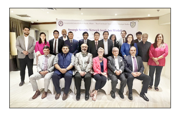
Security Trends & Challenges in South Asia Seminar

Security Trends & Challenges in South Asia Seminar (Aug 2023): NESA hosted an event in Dhaka with policy discussions and debates focused on issues ranging from emerging security threats and climate change to religious extremism, rule of law issues, and demographic challenges (including the explosive Rohingya refugee crisis in Bangladesh).