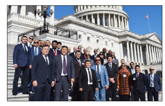
CTSES "Emerging Security Platforms in the Digital Age

CTSES "Emerging Security Platforms in the Digital Age" (Sep 2023): The seminar focused on the proliferation of technology and how its innovations pose a challenge to international security, especially in the Middle East and South Asia. It explored platforms commonly connected to technological innovation, from autonomous vehicles to predictive modeling.