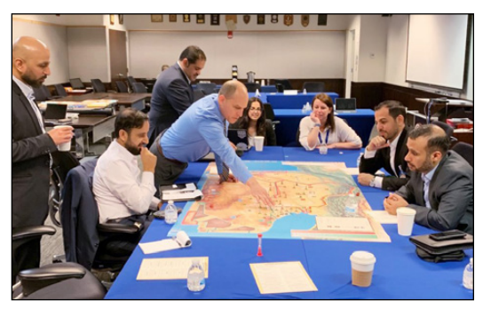
Saudi War Course: Fundamentals of Wargaming