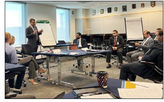
SANDU Faculty Development & Transformation Support Workshop

SANDU Faculty Development & Transformation Support Workshop (Oct 2023): The NESA Center delivered a Faculty Development and Transformation Support Workshop to the Saudi Arabian National Defense University (SANDU) War Wing to explore the Systems Approach to Training (SAT). The SAT was delivered to assist faculty as they begin to transform the War Wing, with the target to become the senior accredited Defense College of Saudi Arabia.