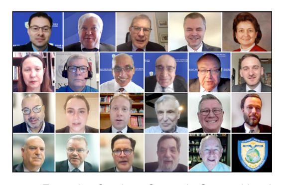
Executive Seminar: Strategic Competition & Regional Cooperation

The virtual Executive Seminar partly focused on understanding strategic competition and U.S.-China competition. The overarching theme was to help participants from NESA countries gain a deeper understanding of the ongoing war in Ukraine, appreciate the complexity of the U.S.-China rivalry, and recognize the difference between the old Cold War and current strategic competition. The seminar also aimed to assess the strategic implications of global power competition on regional security.