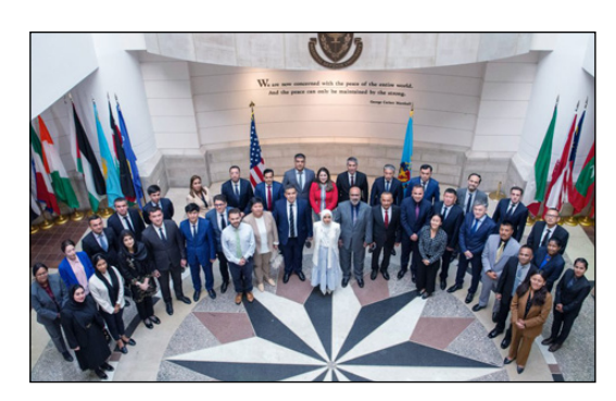
Countering Violent Extremism and the Role of Community Policing: Best Practices