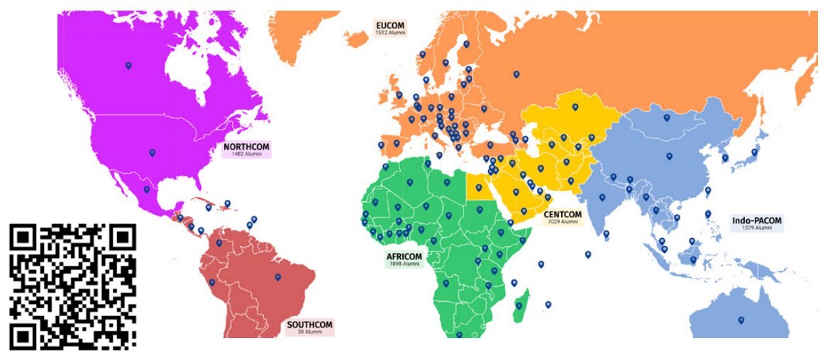
NESA Center Alumni Map (www.NESA-Center.org/Alumni-Map)

The NESA Center boasts a network of nearly 14,000 alumni from 140 countries, with more than a third of whom have achieved flag or general officer rank or the civilian equivalent. Despite DOD budget constraints and the challenges posed by the COVID-19 pandemic, the NESA Center has gained an average of nearly 900 new alumni per fiscal year (FY) since FY13, while re-engaging an average of 500 previous alumni identified as "key influencers" per FY, as part of its efforts to build and sustain relationships.